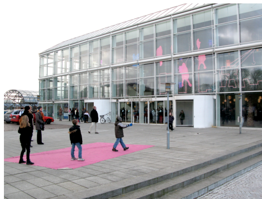
Fig 2. The installation in use. The LED panels themselves are almost invisible.

Situation: Since AbL ran 24/7 for more than 50 days, it was designed to take multiple situations and use scenarios into account. Among them were people passing by versus dedicated visitors of the Concert Hall in relation to scheduled concerts and activities, all together with possible distances, perspectives, and visual obstacles in the public park and the lobby area.