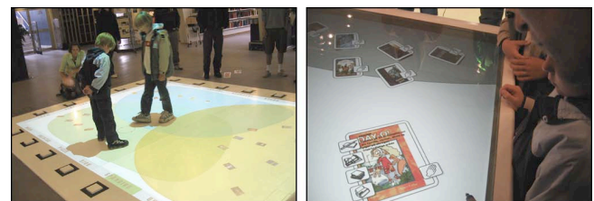
Figure 4: StorySufer A) Browsing for books on the floor, B) Inspecting books on the table.

StorySurfer is an interactive inspiration browser enabling children to explore inspiration from library materials in an untraditional way (figure 4). The floor application displaying book covers is evoked by stepping on buttons on the edge of the floor. Each button is associated with a keyword. Hitting a keyword button will evoke a cloud-like shape on the floor containing book covers associated to the selected keyword; overlapping clouds contain book covers associated with several keywords. A cover can be further examined by moving into the floor. Each person entering the floor is provided with a cursor in the shape of a "magnifying lens" oriented and positioned in front of the user turning towards the centre of the floor. The "lens" is controlled by the children's body movements. Keeping the lens icon still over a projected book cover causes it to enlarge for better inspection and maintaining the position even a bit longer will cause the image to move across the floor to an interactive table. At the table it is possible to examine the chosen books further, apart from the cover image. Book-objects on the table contain buttons to information on author, summary, related books, and access to a printer from where it is possible to print a slip of paper that contains directions to the shelf, the related meta information, and the cover image. The interaction on the floor and on the table both support multiple simultaneous users interacting trough their own cursor.