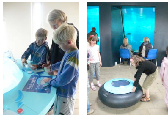
Figure 3 – Visitors constructing fish using RFID construction kit (left) and exploring the digital ocean with the Hydrosopes (right).

The prototypes built at the Kattegat Centre allow visitors to create their own species of fish by combining pieces from a physical construction kit containing a variety of heads, bodies, tails and fins from existing species of fish. The parts of the construction kit are created from acrylic and have an embedded RFID tag that give each piece a unique identity. A table with a rounded display in the middle set the stage for visitors to create their own fish (figure 3 left). Three RFID antennas are embedded in the table surface and invites visitors to experiment with various combinations from the construction kit. As the visitors construct their fish, the screen in the centre of the table shows a digital representation of the fish and provides simple information about the specific parts being used and the overall characteristics of the emerging fish (strength, speed etc.). Having created a fish, visitors can release the fish into a digital ocean where it will live with the other fish that previous visitors have created. Depending on the characteristics of the fish, it will inhabit specific places in the sea (shallow water, deep water, etc.). The digital ocean is mapped onto the physical floor surface of the exhibition space. The only way to explore the ocean is through the use of digital hydrosopes that can be pushed around the floor (figure 3, right).