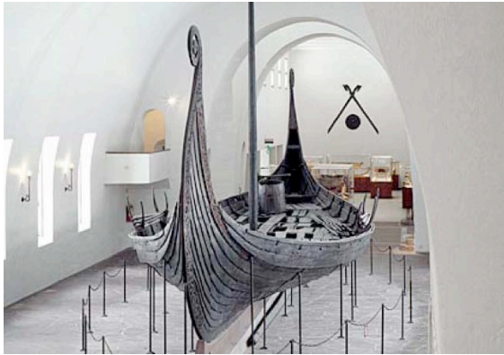
Figure 2: The interior layout of the Vikingskipshuset

each side of the ships (see figure 2). At the far end of the museum is a collection of artifacts displayed in classical montres. This striking layout of the museum seems to install a certain sense of awe as visitors are presented with this somewhat solemn setting. The reconstructed ships are guarded by a fence clearly indicating that the ships are not to be touched. This style of exhibition is found throughout the museum. An obvious reason for this is of course that the exhibited items do not take well to years of human touch. In light of the recent developments in museum exhibition design, it is however striking that the museum has chosen to maintain this traditional approach to presenting the exhibition.